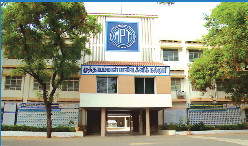
Muthayammal Polytechnic College

Mechanic (Motor Vehicle), Electrician, Fitter, Wireman