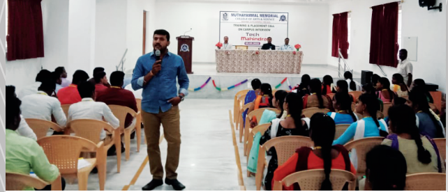
Placement Drive- Tech Mahindra