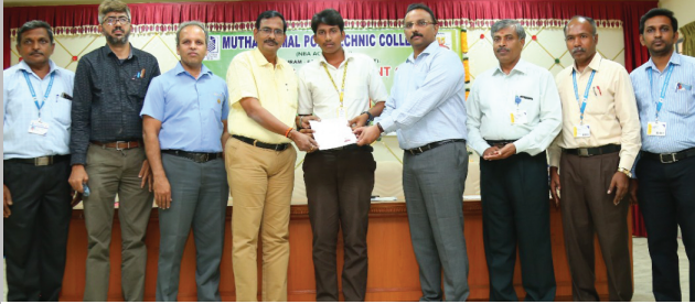
Campus drive - TVS Brakes India pvt Ltd for 22 consecutive years