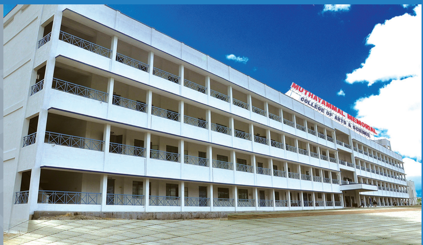
Muthayammal Memorial College of Arts & Science