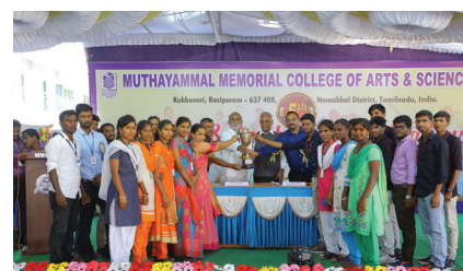
Best Department award (Physics)