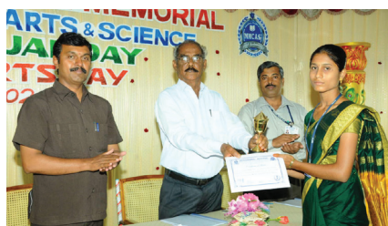
Best Student Award

She achieved 1 st Place in Asian Power lifting Competition at Istanbul, Turkey .